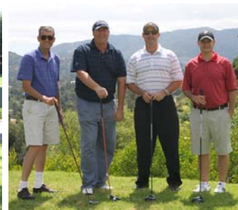
Guests enjoyed a day of FUN on the Golf Course, Dinner, Contests, Auction, Raffle Prizes and MORE!