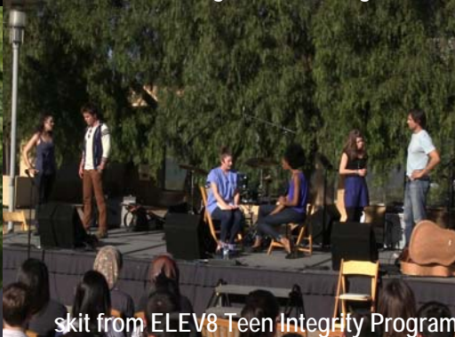
skit from ELEV8 Teen Integrity Program